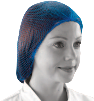
Blue Heavy Duty Hairnet OHN01000 1x100

Open weave nylon hairnet with an elasticated edge.