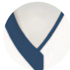
White with Blue Trim