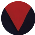
Red with Black Trim