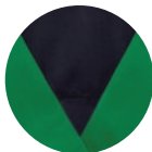
Navy with Green Trim