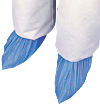
Blue 14" Overshoes OOS00001 1x100

Pal CPE Overshoes are made from a high quality embossed polyethylene providing strength and grip on slippery floors. They are elasticised at the ankle to ensure a good fit.