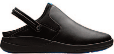
Refresh Microfibre Clog