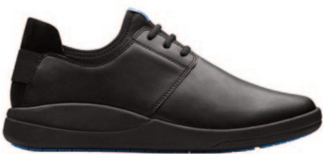
Relieve Microfibre Lace Up Shoe

Dual Density Insoles are not included and must be purchased separately.