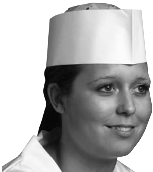
Paper Forage Hat OHF00001 1x100

Made from strong, crisp paper, this self adjustable hat has either a tucked or self-adhesive closure.