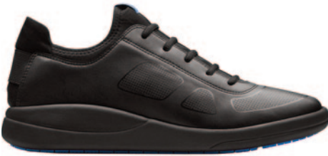
Transform Microfibre Trainer