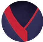
Royal Blue with Red Trim