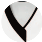
White with Black Trim