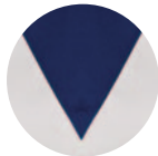
Royal Blue with White Trim