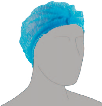
Blue Mob Cap OMCB0001 1x100

Made from a soft, comfortable, thermally bonded polypropylene fibre with an encapsulated double-elastic edge.