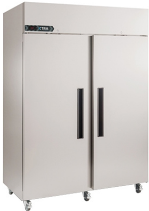
Foster Double Door Cabinet Fridge

Model: XR1300H Size: 1390mm W x 850mm D x 1985mm H Capacity: 1300Ltr Stock Code: WXFR1300