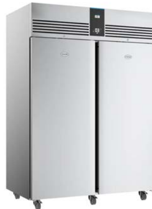
Foster EcoPro G3 Double Door Fridge

Model: EP1440H Size: 1440mm W x 855mm D x 2080mm H Capacity: 1350Ltr Stock Code: WREP1440