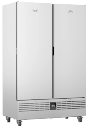
Foster Double Door Slimline Fridge

Model: FSL800H Size: 1200mm W x 700mm D x 1910mm H Capacity: 800Ltr Stock Code: WRS0800