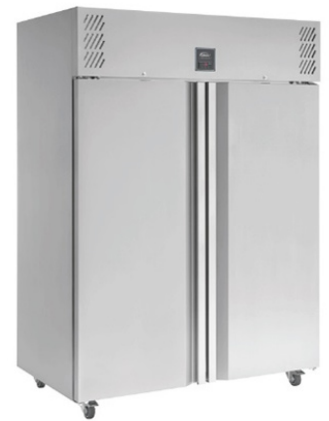
Williams Double Door Refrigerator

Model: HJ2 Size: 1400mm W x 824mm D x 1960mm H Capacity: 1295Ltr Stock Code: WRHJ0002