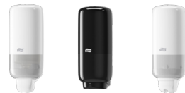
CTSD0601 CFSD0001 CTSD0600